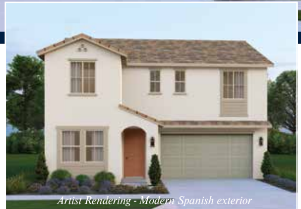
Artist Rendering - Modern Spanish exterior